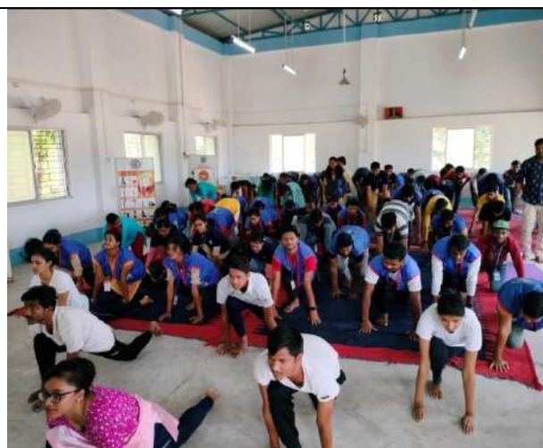
International Yoga day celebration on 21 st June, 2023