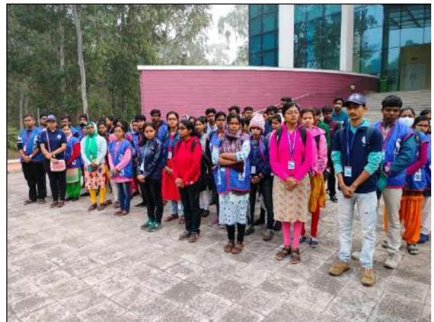
Republic Day Celebration on 26.01.2023 at Vidyasagar University Campus

DB Vu 23.01.2023 09:09 22.42965, 87.29863 Dr. Harekrishna Road, C7HX+RF8, Rangamati, Midnapore.