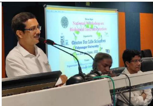
National Workshop on Biological Instrumentation in June 2022