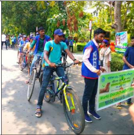
Cycle rally and Swachhata Action Plan to aware about different environmental issues