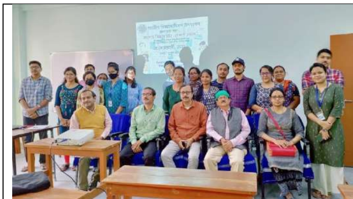
National Science Day programme organized by the CLS

The centre now regularly organizes short term training courses in different branches of life sciences.