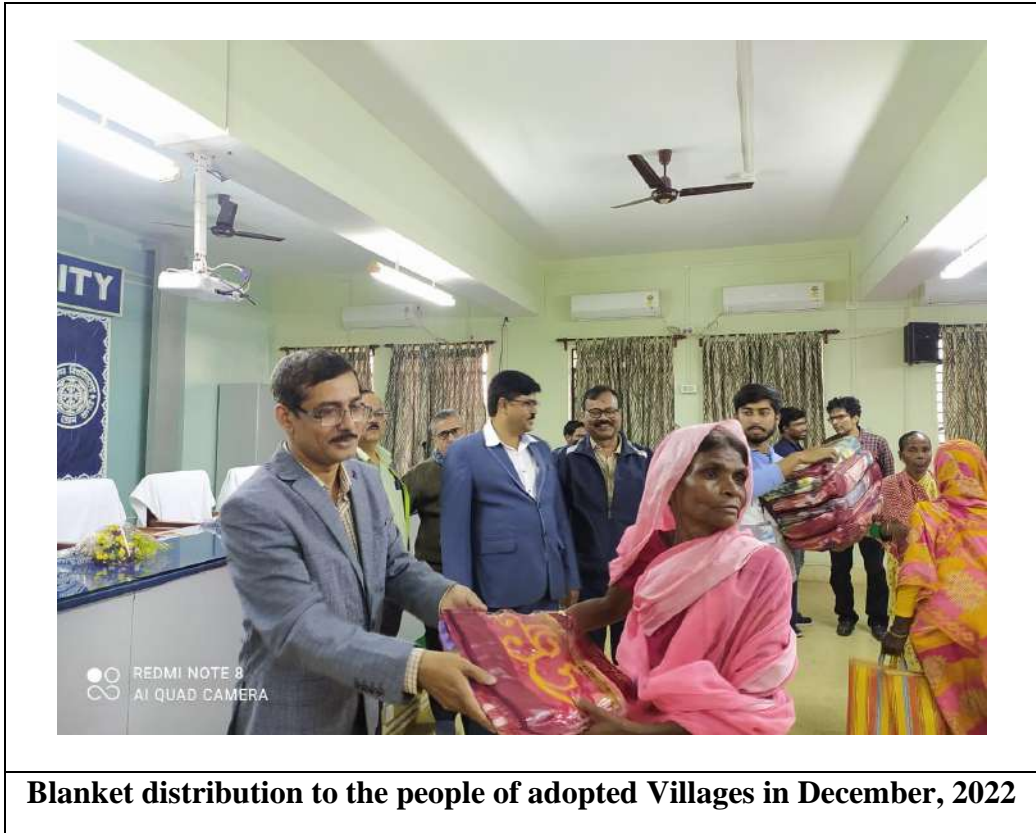
Blanket distribution to the people of adopted Villages in December, 2022