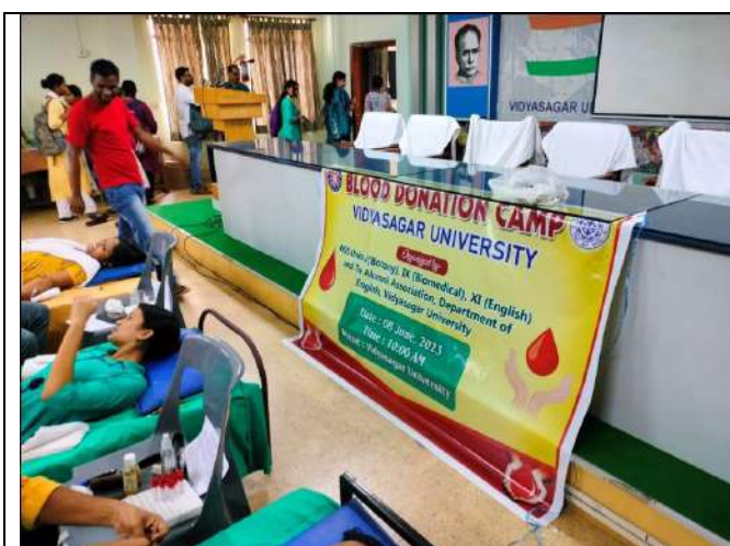
Blood donation programme