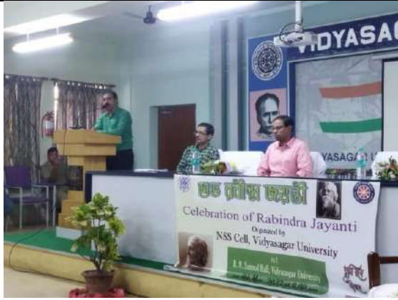
Celebration of Rabindra Jayanti, 2023