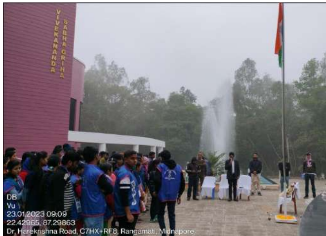
Celebration of Netaji Birth Day on 23 January, 2023