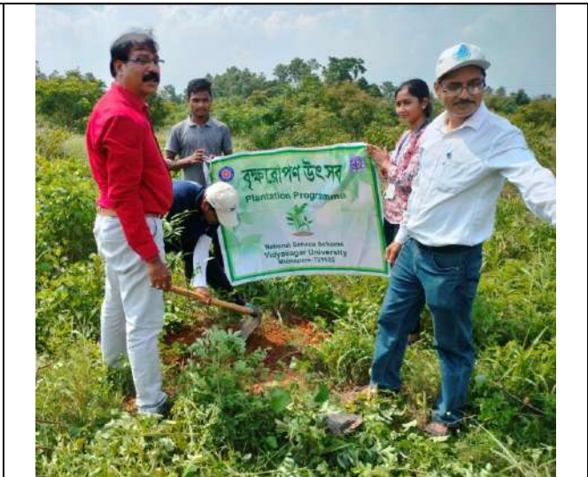
Programme on World Environment Day celebration on 5 th June, 2023.