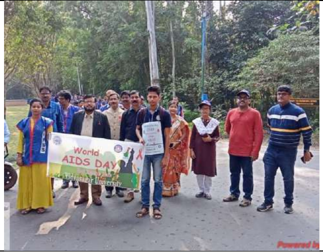
Celebration of World AIDS Day 01.12.2022