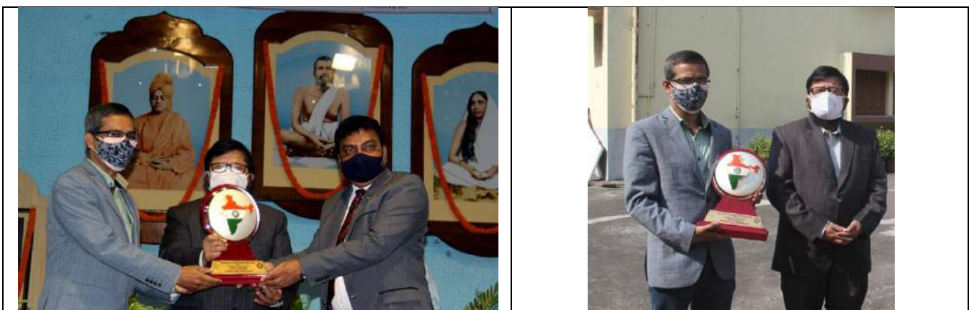
State NSS award for best activity for 2018-2019 was received by Hon'ble Vice Chancellor and Programme Coordinator on 6 th January, 2022